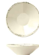
5 oz. Fruit Bowl No. FH-511MEL H 1 1/8 3 doz./8# • .42 cu. ft.