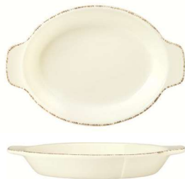
13 oz. Oval Skillet No. FH-751 H1¼ W6 L8¾ 2 doz./24# • .7 cu. ft.