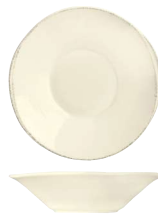
12 oz. Grapefruit Bowl No. FH-513 H1 1/8 D6 1/2 3 doz./21# = .7 cu. ft.