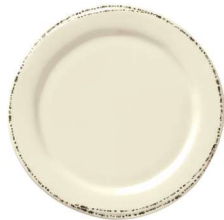
6 3/4" Plate, MR No. FH-600MEL H 5/8 3 doz./14# • .53 cu. ft.

The Farmhouse melamine selection gives you the flexibility to take the meal anywhere. Melamine's superior durability makes it ideal for outdoor or high-volume environments.