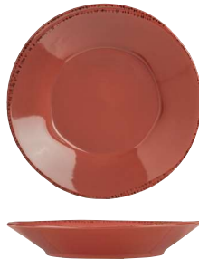
27 oz. Soup/Salad Bowl Cream No. FH-514 Butter No. FH-514B Blue Hen No. FH-514H Barn Red No. FH-514R H1 1/8 D9 1 doz./18# = .7 cu. ft.