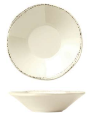
12 oz. Grapefruit Bowl No. FH-513MEL H 1 1/8 3 doz./19# • .76 cu. ft.