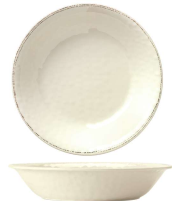
130 oz. Serving Bowl No. FH-590MEL H 2 3/4 D 13 3/4 6 pcs./10# • .6 cu. ft.