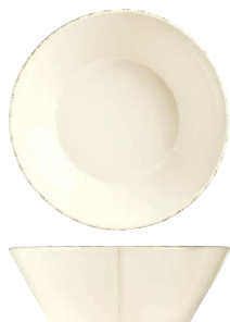
30 oz. Serving Bowl No. FH-524 H2 3/4 D7 1 doz./16# = .5 cu. ft.