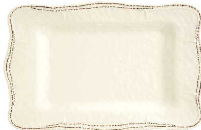
17" x 11" Rectangle Tray No. FH-580MEL H 7/8 6 pcs./10# • .4 cu. ft.