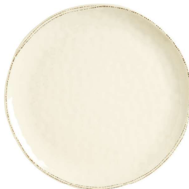
16" Round Platter No. FH-570MEL H 3/4 6 pcs./14# • .4 cu. ft.