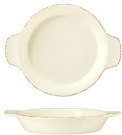
13 oz. Round Skillet No. FH-750 H1¼ W6¾ L8¼ 2 doz./23# • .7 cu. ft.

5-Year No-Chip Warranty | Fully Vitrified | Polished Foot | Storytellers Collection