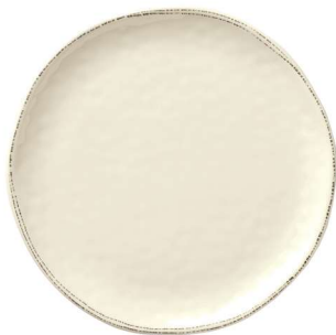
12 1/2" Round Tray No. FH-550MEL H 3/4 6 pcs./10# • .4 cu. ft.