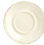
6 1/4" Saucer No. FH-519 H1 WL 2 1/2" 3 doz./22# = .6 cu. ft.