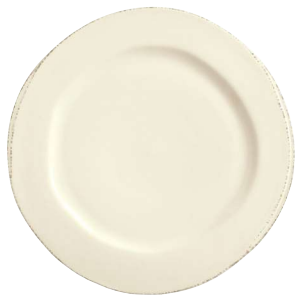
6 3/8" Plate, MR No. FH-600 H 3/8" 3 doz./23# = .5 cu. ft.

5-Year No-Chip Warranty | Fully Vitrified | Polished Foot | Storytellers Collection