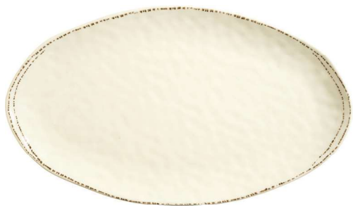
20 1/2" x 11 1/2" Oval Platter No. FH-560MEL H 3/4 6 pcs./13# • .5 cu. ft.