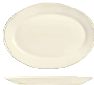
12½" x 9" Oval Platter No. FH-508 H1 1 doz./27# • .7 cu. ft.