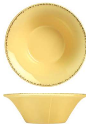
20 oz. Soup Bowl Cream No. FH-515 Butter No. FH-515B Blue Hen No. FH-515H Barn Red No. FH-515R H2 3/8 D7 1/2 1 doz./14# = .4 cu. ft.