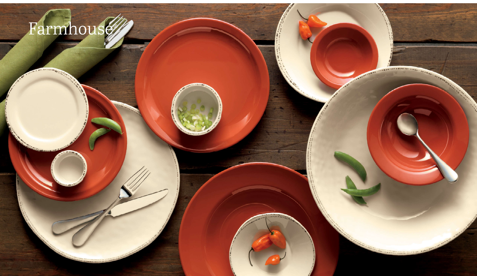
Shown: Farmhouse and Cantina® Uncarved melamine dinnerware and serveware and Reserve by Libbey® Equity flatware