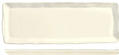
16" x 5½" Long Tray No. FH-529 H1 1 doz./31# • .7 cu. ft.