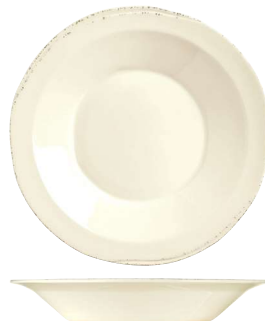
30 oz. Pasta Bowl No. FH-525 H1 3/4 1 doz./26# = .9 cu. ft.