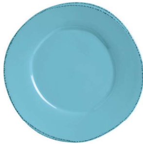
6 3/8" Plate Cream No. FH-500 Butter No. FH-500B Blue Hen No. FH-500H Barn Red No. FH-500R H 3/8" 3 doz./21# = .5 cu. ft.