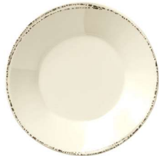
9" Plate, MR No. FH-602MEL H 5/8 1 doz./10# • .43 cu. ft.