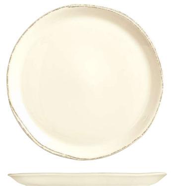
13½" Round Platter/ Pizza Plate No. FH-527 H1½ 6 pcs./21# • .6 cu. ft.