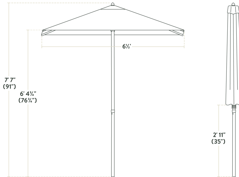
Aluminum Square Umbrella - 6 1/2'