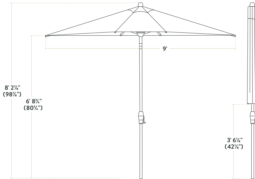
Aluminum Round Auto Tilt Umbrella - 9'