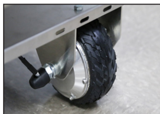
Integrated Hub Motor Wheels