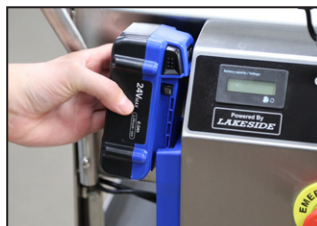
Hot Swappable Batteries