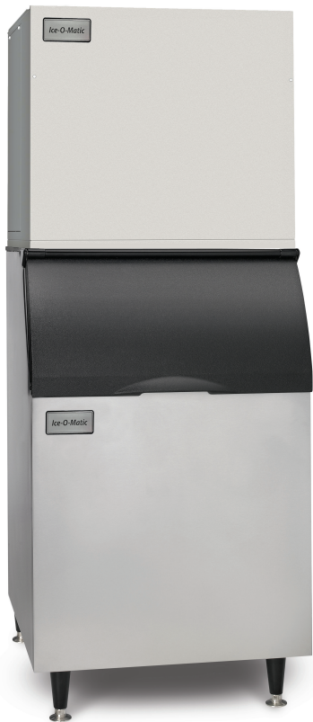
MFI2306 ON B55