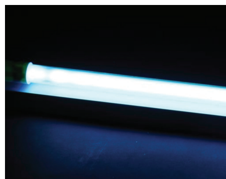
UV sanitizing water tank