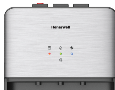
Compressor temperature control Hot temp. 194°F Cold temp. 40°F