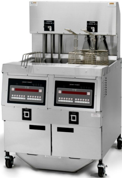
OGA 322 2-well gas auto lift open fryer

OGA 321 1-well gas OGA 322 2-well gas OGA 323 3-well gas