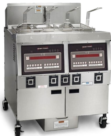
OFG 322 2-well gas open fryer with Computron™ 8000 control

OFG 321 1-well gas OFG 322 2-well gas OFG 323 3-well gas