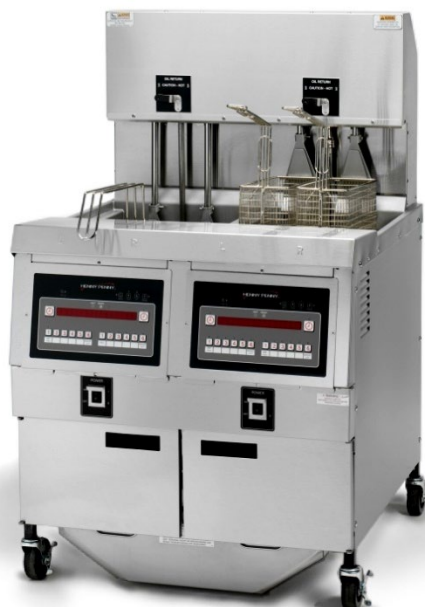
OEA 322 2-well electric auto lift open fryer

OEA 321 1-well electric OEA 322 2-well electric OEA 323 3-well electric