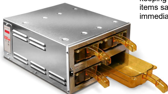
MPC 22 modular multi-purpose holding cabinet

Henny Penny multi-purpose holding cabinets are ideal for keeping small quantities of hot menu items safe, appetizing and ready for immediate serving or packing.