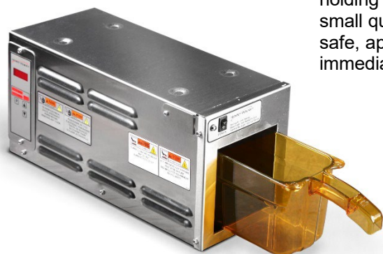
MPC 1L modular multi-purpose holding cabinet

Henny Penny multi-purpose holding cabinets are ideal for keeping small quantities of hot menu items safe, appetizing and ready for immediate serving or packing.