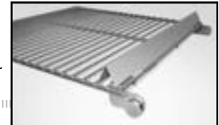
Magnetically adjustable shelves provide flexibility for a variety of product choices