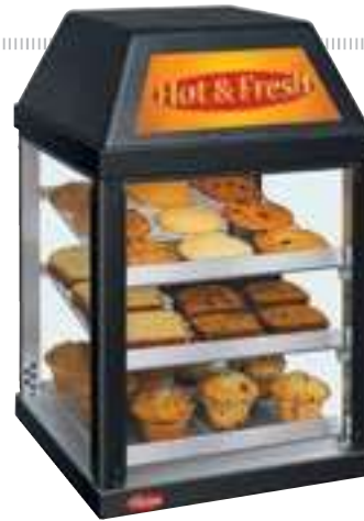
MDW-1X with standard Designer color and optional hood with backlit sign cut out on one side (sign included)