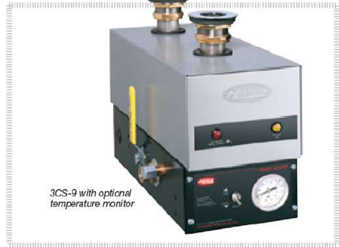
3CS-9 with optional temperature monitor