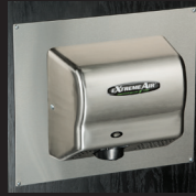
AP ADAPTER PLATE