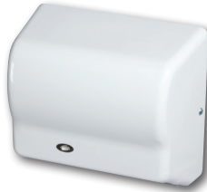
Steel White Epoxy