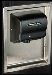
ADA-RK RECESS KIT