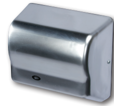
Steel Satin Chrome