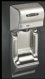
ADA-WG WALL GUARD