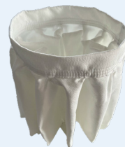
DP-E1-106: STANDARD 3.0 MICRON 12 POCKET FILTER