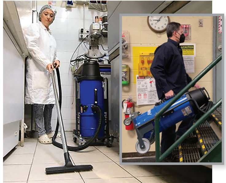
DP-E1-H HEPA Filtered