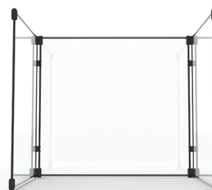
22 x 20 x 16 PART NO: 34474

Our patent pending Cubicle Personal Safety Partition was designed specifically to fit the standard 24 x 18 school desk to create full coverage and provide protection. Custom partition sizing is available upon special request to fit your specific application needs.