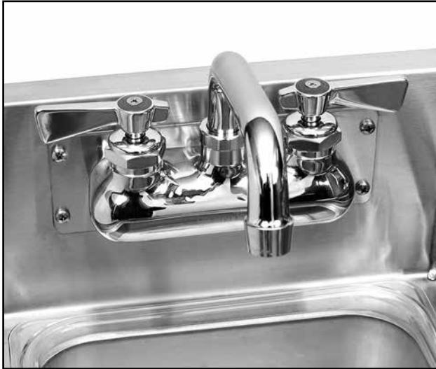
Backsplash mount faucet shown with swing spout