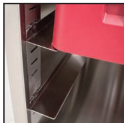
Adjustable Stainless Steel Glass Rack Slides

Item #: _____ Qty #: _____ Model #: _____ Project #: _____