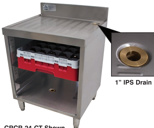
CRCR-24-CT Shown Holds Up To 3 Glass Racks