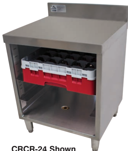
CRCR-24 Shown Holds Up To 3 Glass Racks

Item #: _____ Qty #: _____ Model #: _____ Project #: _____