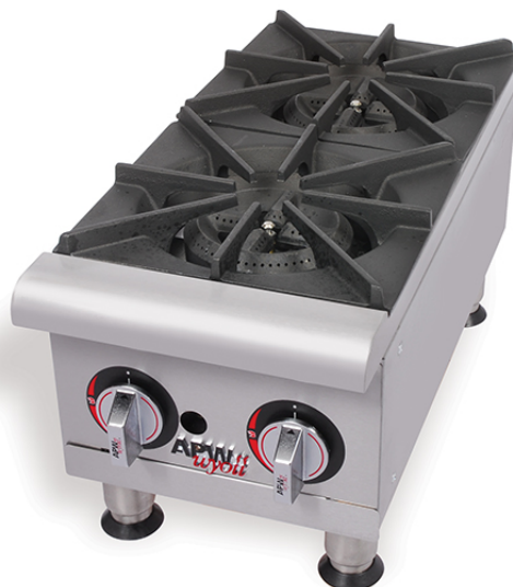
Model GHP-2i Standard Gas Hot Plate