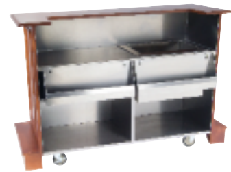
Standard stainless steel interior shown above.

See page 76 for Antique Cherry Collection