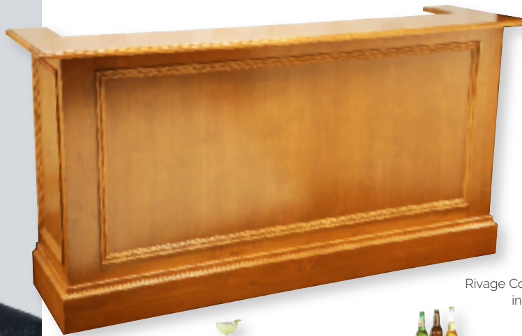
Rivage Collection - #76622 (M) in puritan pine