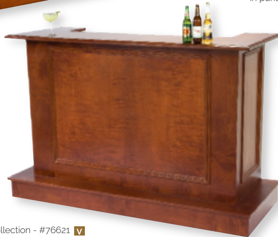
Rivage Collection - #76621 (M) in antique cherry, shown with optional base footrest