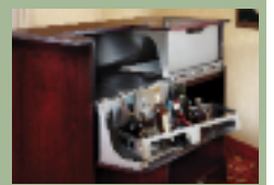
Convertible speed rail, page 63.

ADD A CONVERTIBLE DOUBLE SPEED RAIL TO ANY GENEVA BAR!