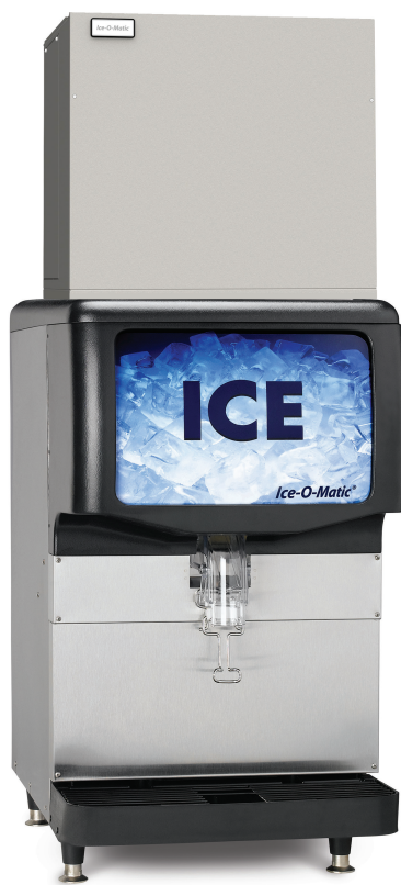
GEM2006 ON IOD250