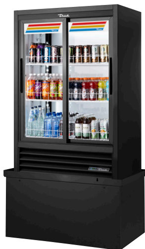
Shown with optional GASI Stand: Part# 216820