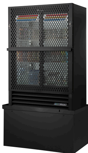
Shown with optional Vandal Panel: Part#939322