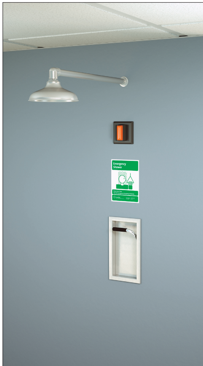
Note: Shown with optional AP280-235 electric light and alarm horn unit (sold separately).