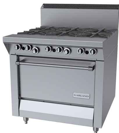
Model M43R Shown with Optional Backguard