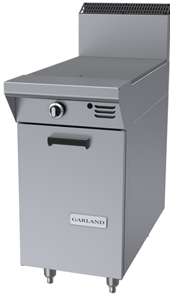
MST6S-E Shown with Optional Backguard