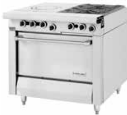
Model MST54R (valve control panel not as depicted) Range with Front-Fired Hot Top and Two Open Burners