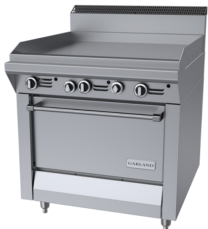
Model MST47R-E Shown with Optional Backguard