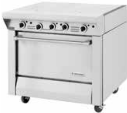
Model MST46R (valve control panel not as depicted) Two Section Even Heat Hot Top Range