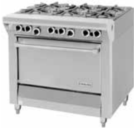
Model MST43R (valve control panel not as depicted) Range With Six Open Star Burners