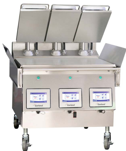
Model XPG36 Shown with flared grease cans