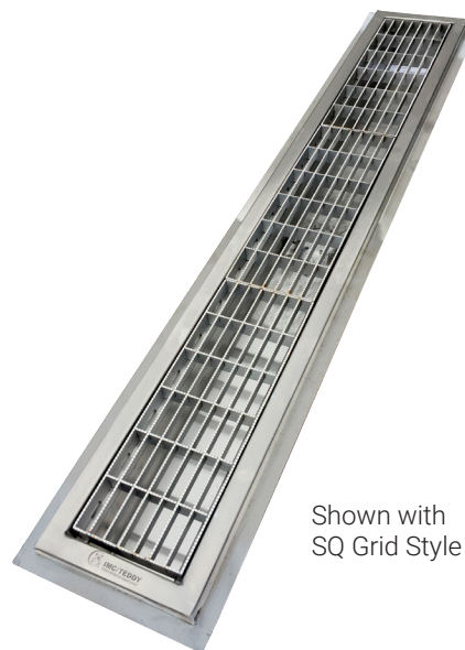
Shown with SQ Grid Style Grating

Setting frame for waterproof membrane and/or integral seepage flange with "weep" holes can be added for wet floor areas.