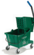
36908 – ●●● 26 qt Mop Bucket/Wringer Combo