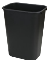
342928 – ● 28 qt Office Wastebasket 342941 – ● 41 qt Office Wastebasket