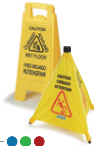
36909 – ●●● Wet Floor Sign 36942 – ●●● Caution Pop Up Cone