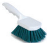
40541 – ● 8" Sparta® Spectrum® General Clean Up Brush