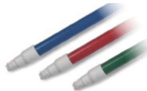
40225 – ●●● 60" Sparta® Spectrum® Threaded Fiberglass Handle