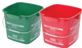
11832 – ● 6 qt Square Suds-Pail® 11829 – ● 6 qt Square Steri-Pail®