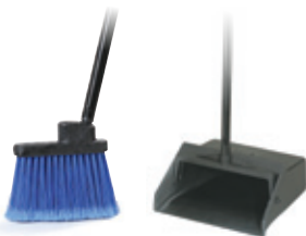
36859 – ● Duo-Sweep® Flagged Lobby Broom with 30" Black Metal Handle 361410 – ● Duo-Pan™ Upright Dustpan with 30" Metal Handle