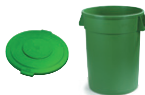
341032 – ● 32 gal Bronco™ Waste Container 341033 – ● 32 gal Bronco™ Waste Container Lid