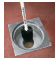
40146 – ● 3" Floor Drain Brush 40236 – ● 36" Plastic Drain Brush Handle