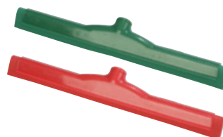
41567 – ●● 18" Spectrum® Plastic Squeegee