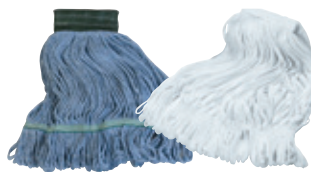
369448B – ● Medium Looped-End Mop 369320 – ● Rough-Surface Looped-End Mop