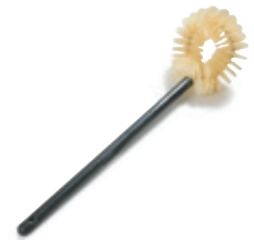
3633 – ● Twisted-In-Wire Bowl Brush