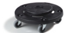
36911 – ● Carlisle Dolly