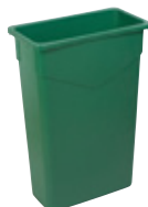
342023 – ●●● 23 gal TrimLine™ Waste Container