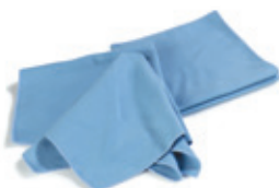
36334 – ● Microfiber Cleaning Cloth