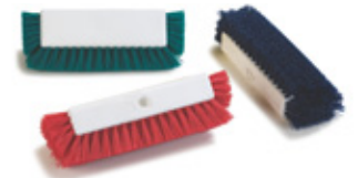
40422 – ●●● 12" Sparta® Dual Surface Floor Scrub with Side Bristles