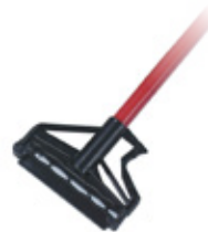
41664 – ●●● 60" Sparta® Spectrum® Quik-Release™ Fiberglass Mop Handle