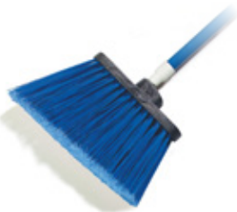
41082 – ●●● 56" Duo-Sweep® Angle Broom

● Front of House ● Back of House ● Restrooms