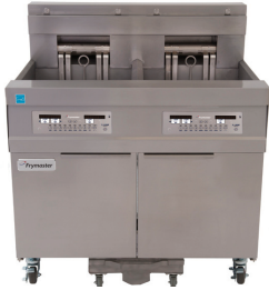
Model Shown: 21814E with optional filtration