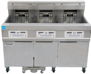
Model Shown: 11814E/RE17/11814E