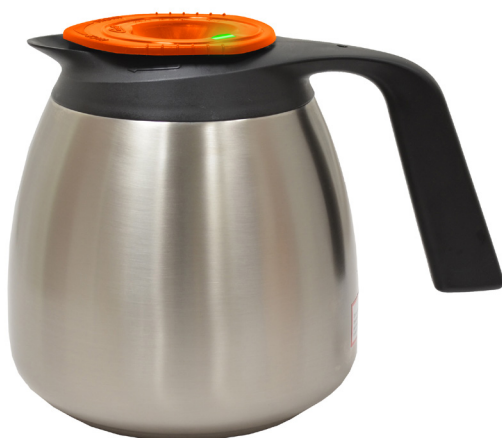
TFT64D 64 Ounce (1/2 Gallon) Decaf Thermal Dispenser