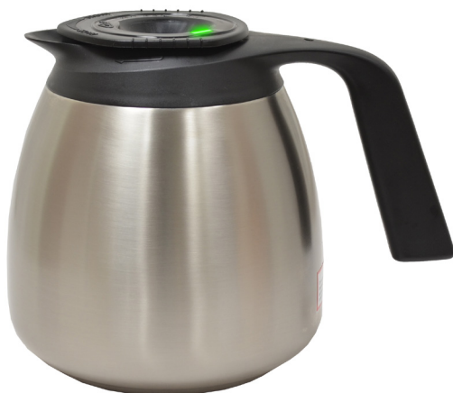
TFT64 64 Ounce (1/2 Gallon) Thermal Dispenser