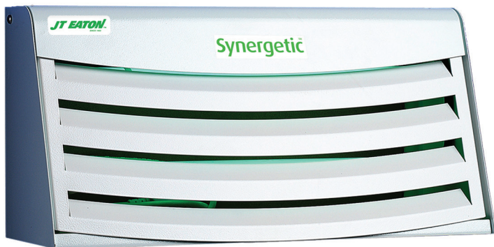
Model No. 1500LV - Includes Two Non-Shatterproof Bulbs And One Glue Board

Power 38 WATTS Dimensions 22" W x 12 1/2" H x 6 3/4" D Coverage (ft²) 850 Weight 13 lb.