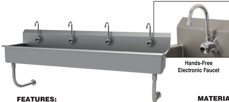
Hands-Free Electronic Faucet