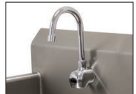
Hands-Free Electronic Faucet