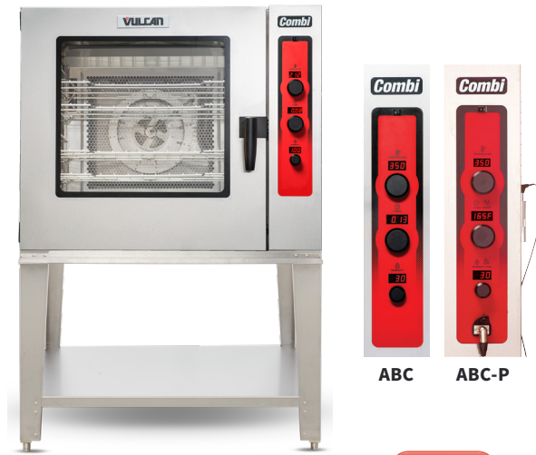
Model ABC7G Shown on stand