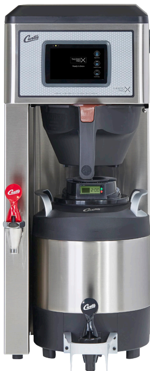
G4TPX1S63A3100 G4 Single 1.0 Gallon Brewer (Dispenser sold separately)