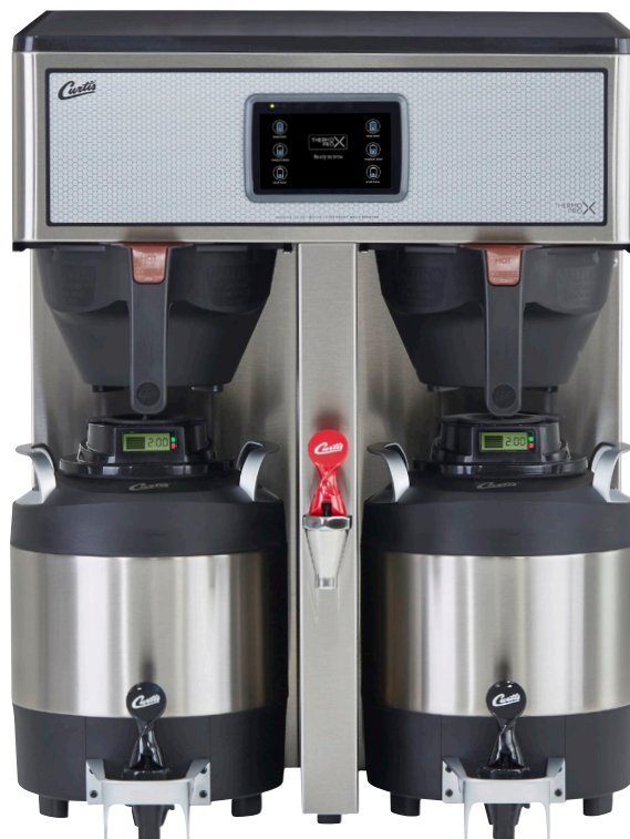
G4TPX1T10A3100 G4 Twin 1.0 Gallon Brewer (Dispensers sold separately)