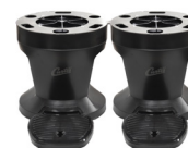
TSS2A000 Twin Base