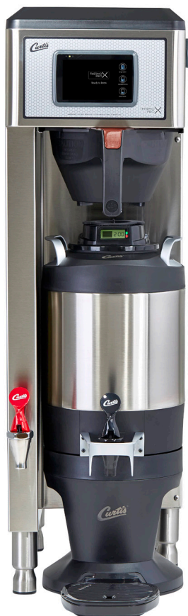
G4TPX2S63A3100 G4 Single 1.5 Gallon Brewer (Dispenser sold separately)