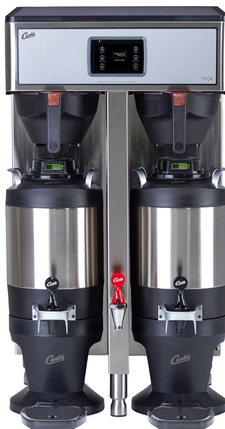
G4TPX2T10A3100 G4 Twin 1.5 Gallon Brewer (Dispensers sold separately)