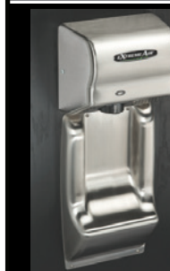
ADA-WG WALL GUARD