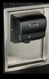
ADA-RK RECESS KIT