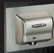
AP ADAPTER PLATE