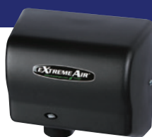
Steel Black Graphite