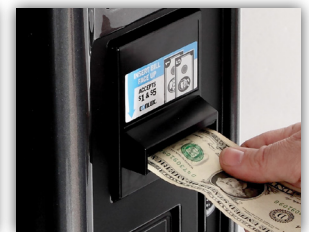
Premium Currency Acceptors

Keeps customers satisfied and reduces service calls for misloaded product.