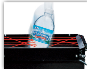
iVend® Guaranteed Delivery System

Keeps customers satisfied and reduces service calls for misloaded product.