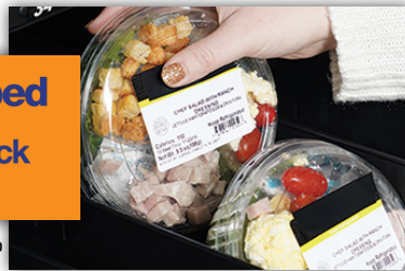
First in First Out Loading Reduces Spoilage up to 30%

Health Safety Monitor Equipped This monitor allows operators to stock dairy and cold food products.