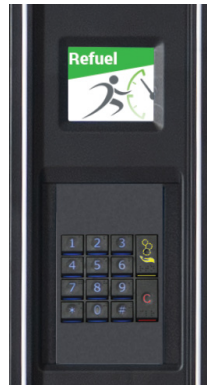
Braille Keypad Standard