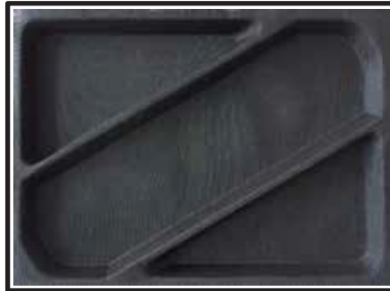
Giant Bread Form Giant Bread Form Item 6117

Overall Size: 13 1/2" x 18 1/4" Cavity Dimensions Top: 12 1/4" x 3" Bottom: 11 1/2" x 1" Composition: Knitted fiberglass with silicone coating that conforms to FDA regulations. This baking form is intended for baking bread products only.