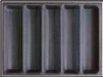
5 Channel Bread Form, Bread Form Item 6103

Overall Size: 13 1/2" x 18 1/4" Cavity Dimensions Top: 12 1/4" x 3" Bottom: 11 1/2" x 1" Composition: Knitted fiberglass with silicone coating that conforms to FDA regulations. This baking form is intended for baking bread products only.