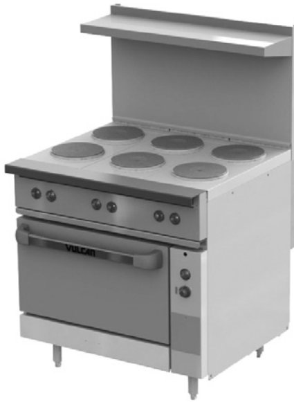
Model EV36S-6FP208 shown with adjustable legs