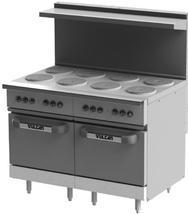
Model EV48SS-8FP208 shown with adjustable legs