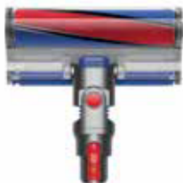
Soft roller cleaner head