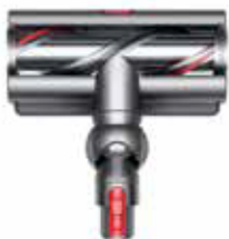
High Torque cleaner head