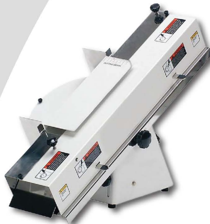
DXSM-270 (bread slicer)