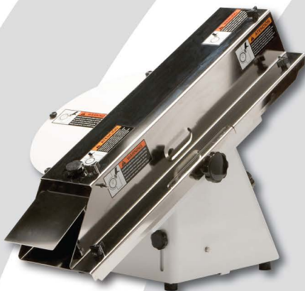
DXSM-270C (compact bread slicer)

The DXP-GF001 series bread slicer is a reliable high-quality table top slicer that can be used for continuous operation. Great for use in Supermarkets Bakeries, Schools, Deli's, Retail Bakeries, Sub Shops, Hospitals, Restaurants, Bagel Shops, Caterers and more!