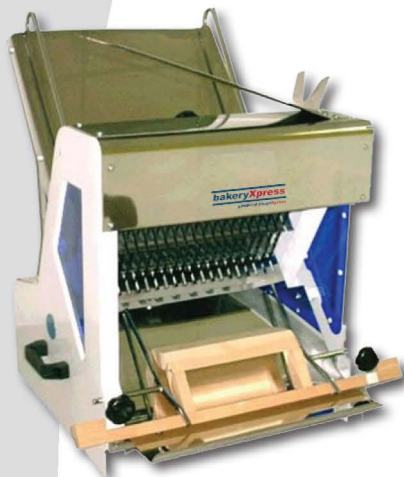
DXP-GF001 (gravity feed bread slicer)