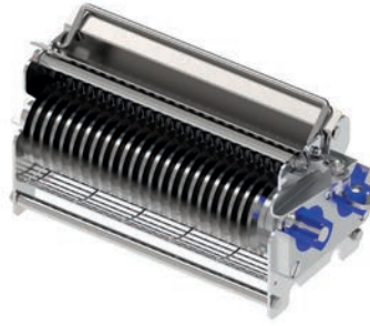
48-blade 3/8" (10MM) Strip Cutter Fajita cradle optional