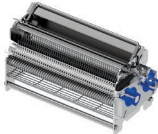
96-blade tenderizer cradle optional

Certified to UL Standard 763 and NSF Standard 08 Certified to CSA Standard C22.2