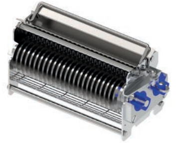
32-blade 5/8" (15MM) 24-blade 7/9" (20MM) Strip Cutter Fajita cradle optional