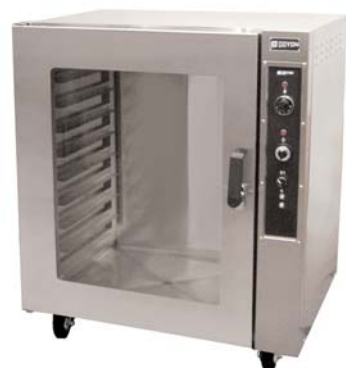
DPW10 10 pans