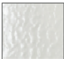
Embossed White Gavalume Steel