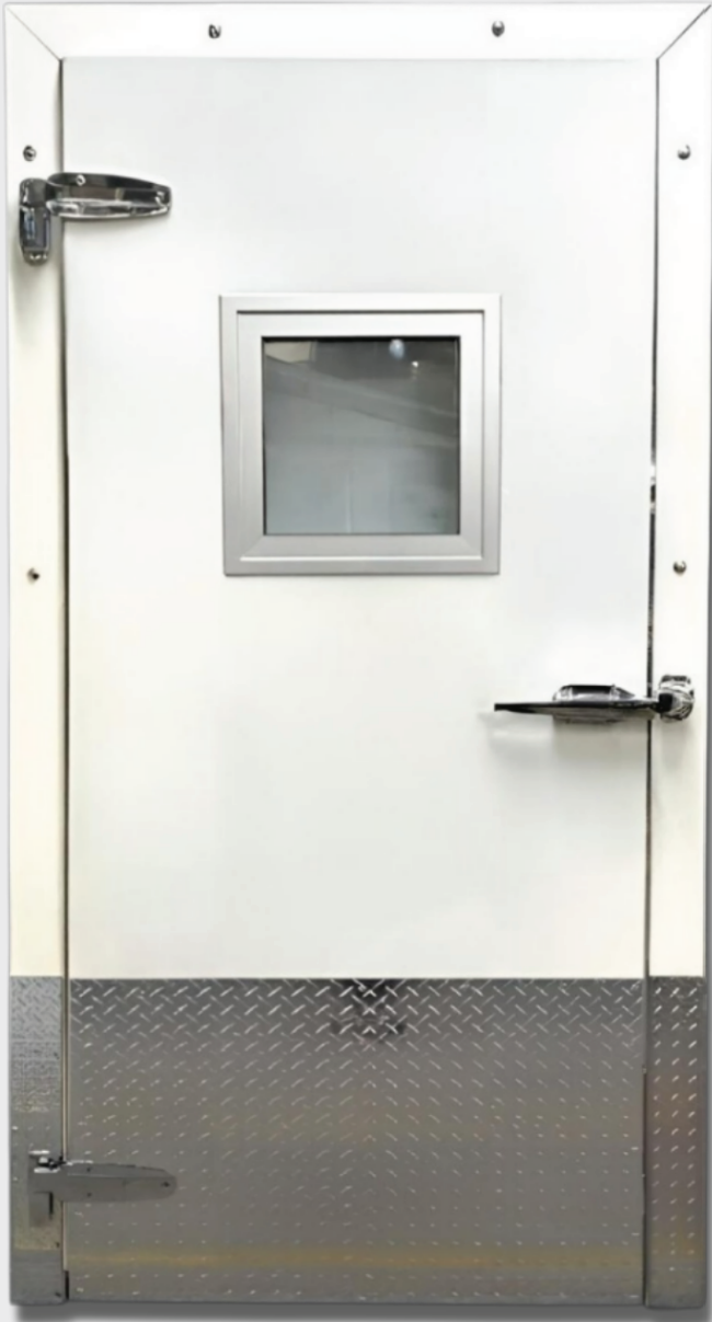
Shown: Single Infitting Swing Door